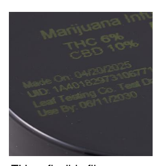
TIJ on flexible film