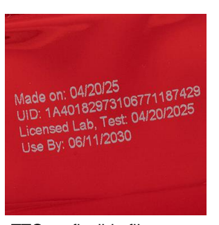
TTO on flexible film