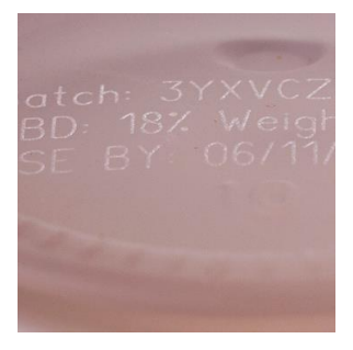
Laser on glass