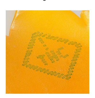
CIJ (food safe ink) on gummy

Additional code samples can be found in the Application Sample Guide or by calling or emailing Videojet.