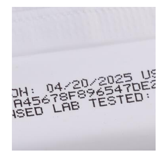
CIJ on flexible film