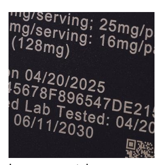
Laser on metal