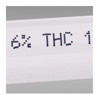
CIJ on glass